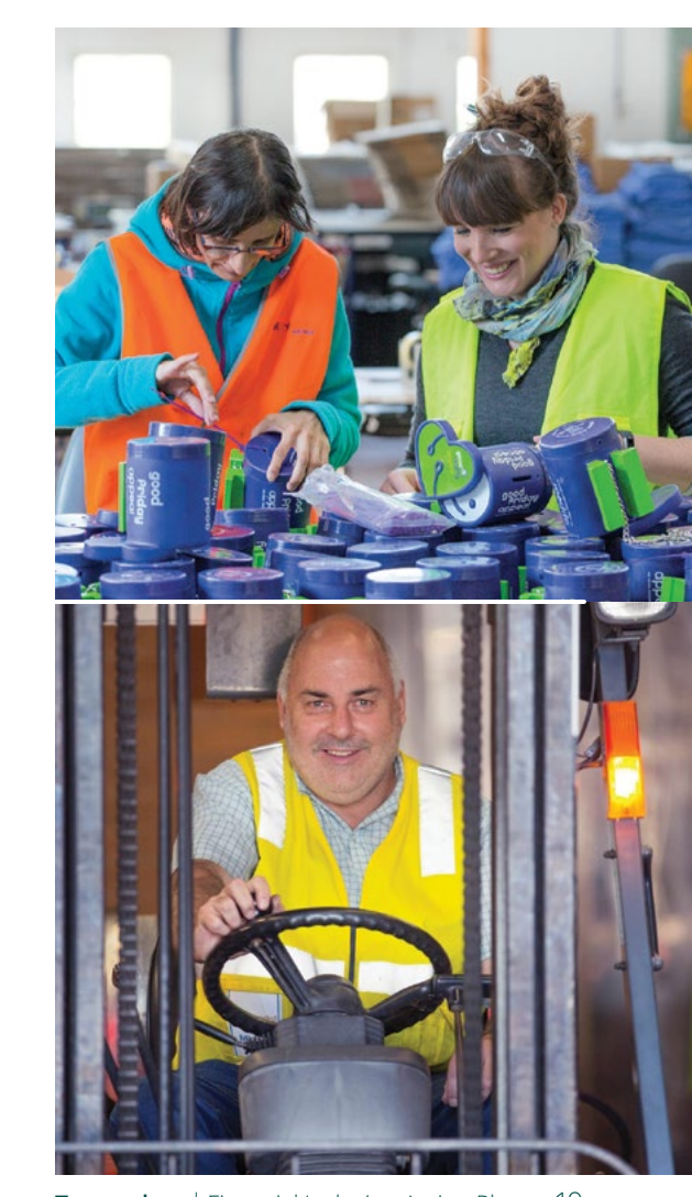
Transurban | Financial Inclusion Action Plan 19

We also provide Ability Works with additional support through our employee volunteering program an in recent times have been leveraging our partnership with Aurecon (a global engineering and infrastructure company) to further support Ability Works—a model which has assisted Ability Works to enter new service revenue streams within the Infrastructure market, and increase their employee base by 15 per cent even through the COVID-19 pandemic.