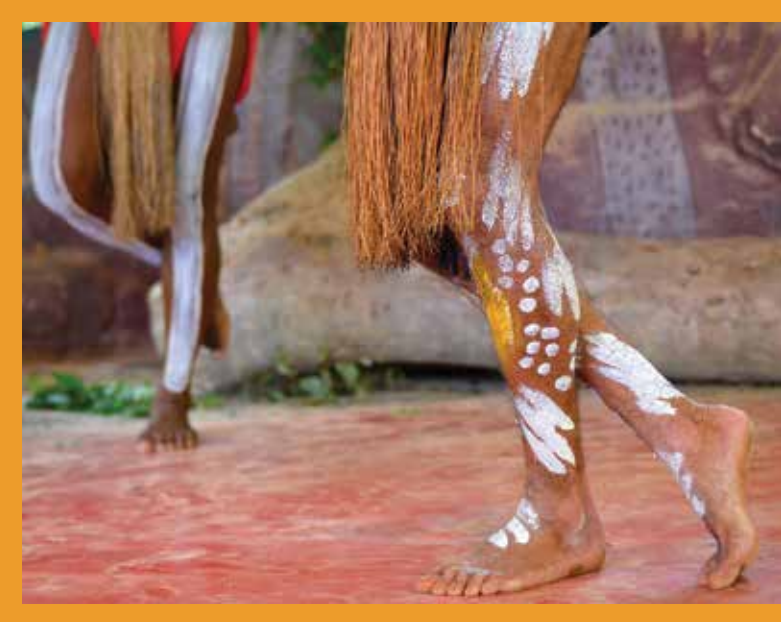
Yirrganydji Aboriginal men dance, Queensland

To enable this, our Innovate RAP is grouped into four key focus areas, Cultural Awareness, Education, Employment and Strong Local Relationships. These areas focus on connecting with and empowering Aboriginal and Torres Strait Islander communities and organisations in the regions in which Transurban operates.